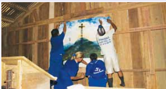
Sharing the Gospel in a practical way in Peru by church-building with our international brothers in Christ