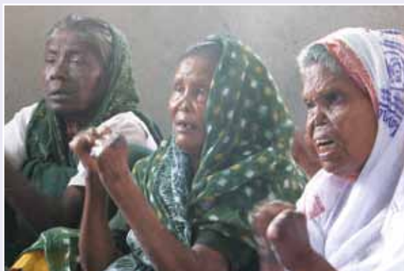
Lepers worshipping in India during Hearts Afire church service at Leper Colony