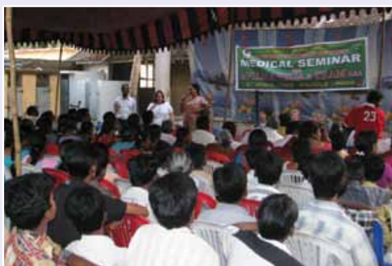
Hearts Afire provides public health education to locals and medical education to health care workers in India